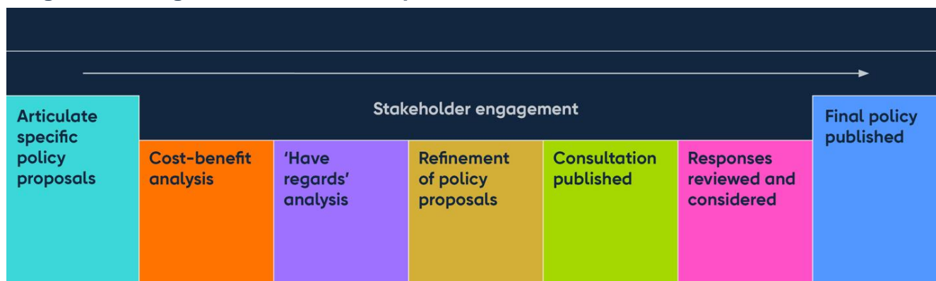
Diagram 3 - Stages within the Development Phase 67

5.45 We consult on our policy proposals via a CP and consider all responses before finalising our policy. Diagram 3 illustrates the stages within the development phase.