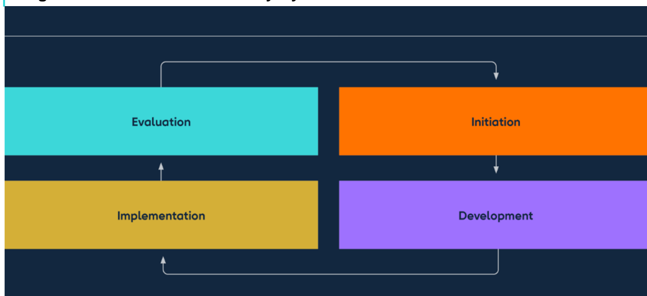
Diagram 1: Overview of the Policy Cycle

5.23 We combine evidence and judgement to make policy that advances our objectives. We collaborate across our policymaking and supervisory functions and work closely with the Bank's financial stability and resolution functions.